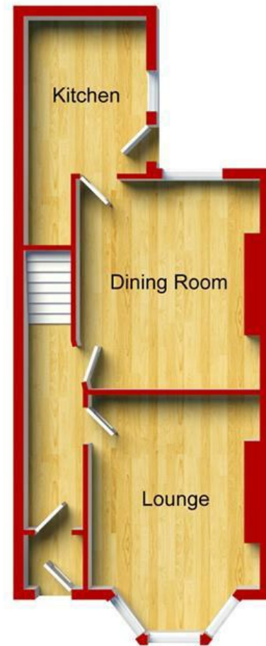
Ground Floor Approximate Floor Area (44.41 sq.m)